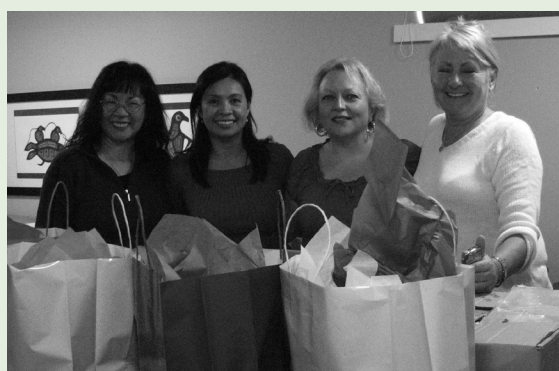
Employees from Xerox put together welcome packages for new clients moving into the shelter. They purchased toiletries, clothing, and other essential items, and then volunteered their time to put together packages. They were also kind enough to donate a photocopier to Ernestine's.