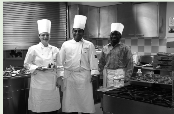
The head chefs from the InterContinental Toronto Yorkville prepare dinner for the clients and staff at Ernestine's. They were joined by their colleagues who turned our shelter into an elegant dining room before serving a delicious meal.